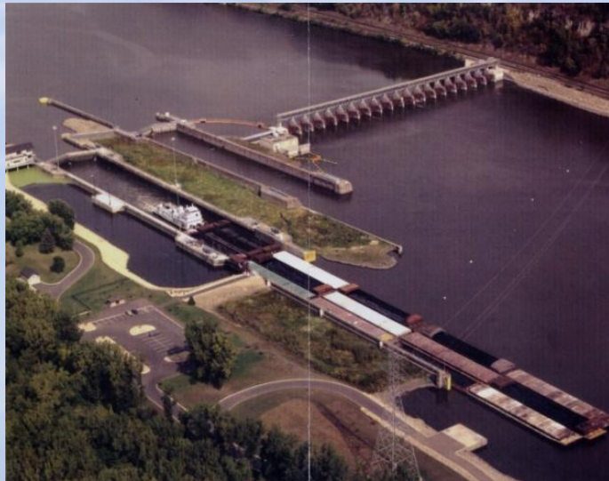
City of Hastings Hydro Project - 4.4 MW Mississippi Lock and Dam #2